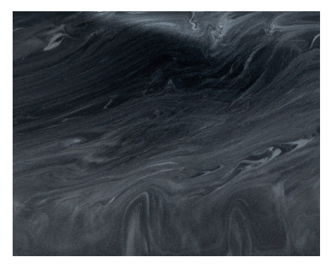
NIMBUS with TITANIUM Accent